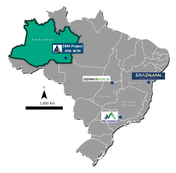
Figure 1. Location of the Ema Project, Brazil.

Brazilian Critical Minerals Limited ( ASX: BCM ) (" BCM " or the " Company ") is pleased to announce the results from metallurgical testwork on a bulk sample from the Ema Rare Earth Project in the Apuí region of Brazil (Figure 1).