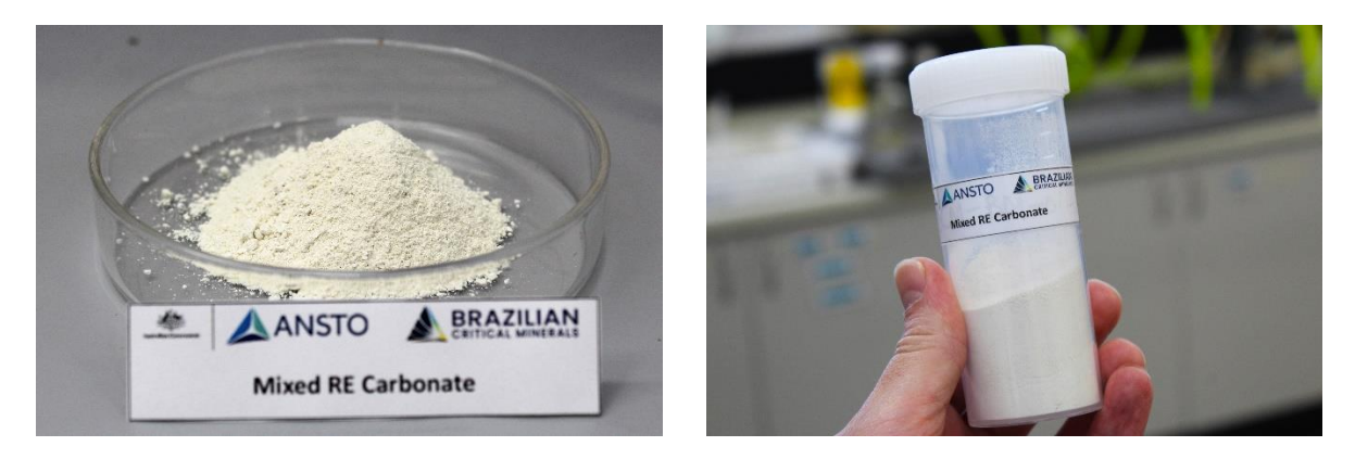
Figure 4. Final Mixed rare earth carbonate product, 33.2 grams, produced at the ANSTO facilities in Sydney.