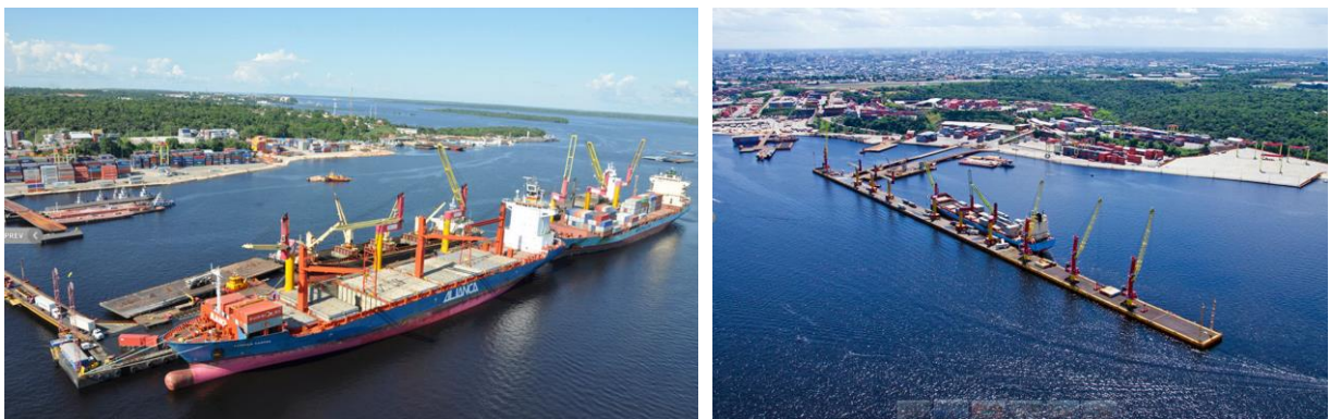
Figure 2. Loading of Panamax sized vessels at the Port of Chibatão, one of the largest private Ports in Latin America.