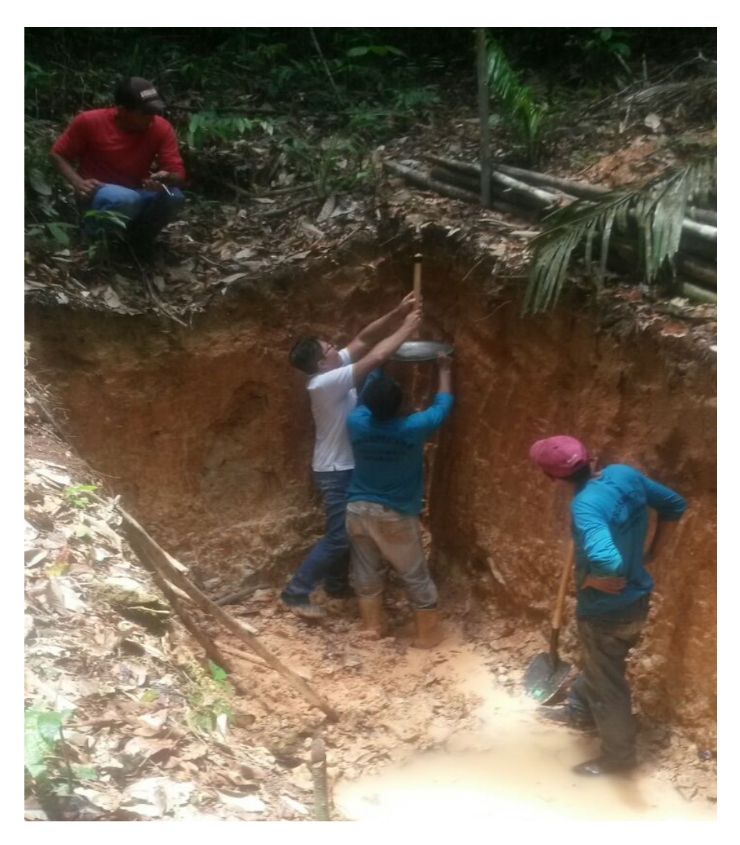
Fig. 3. Channel sampling at Ema 3