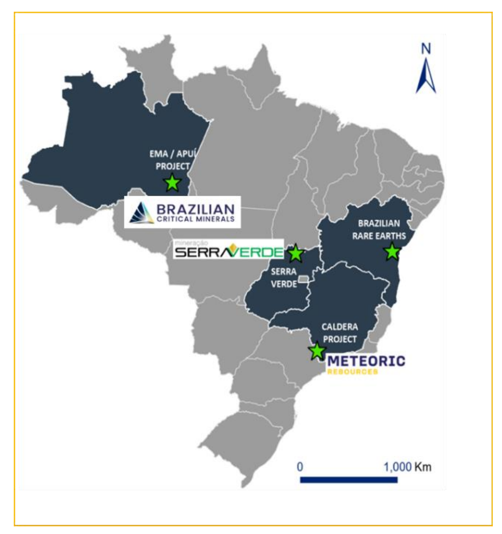
Figure 1. Ema project location in the Apui region of Brazil.

Brazilian Critical Minerals Limited ( ASX: BCM ) (" BCM " or the " Company ") is pleased to announce the phase 2 ammonium sulphate rare earth element (ree) extraction assay results for auger holes drilled at Ema in the Apuí region of Brazil (Figure 1). The tests were conducted at the SGS laboratory in Brazil.