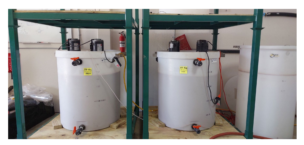
Figure 2: pilot plant in operation

Andre J Douchane, CEO commented: "The initial testing of the revised pilot plant involved using a portion of Ema drill holes to address any potential issues before conducting tests on a Três Estados resource hole. Additionally, due to the challenges of utilising standards and blanks for continuous analysis during a pilot plant test, it was decided to have two different certified assay labs analyse splits of each collected sample.